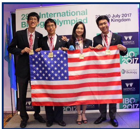
2017 International Biology Olympiad Closing Ceremony, Coventry, United Kingdom

The USABO is a three-tier competition that demands the very best of students in biology theoretical and laboratory knowledge. The top four students from this competition represent the USA at the International Biology Olympiad (IBO) as Team USA. Each member of Team USA has medaled since the USA first competed in the 2003 IBO. In 2007, 2008, 2009, 2011, 2012, 2013, 2015, and 2017, each Team USA member has brought home a gold medal.