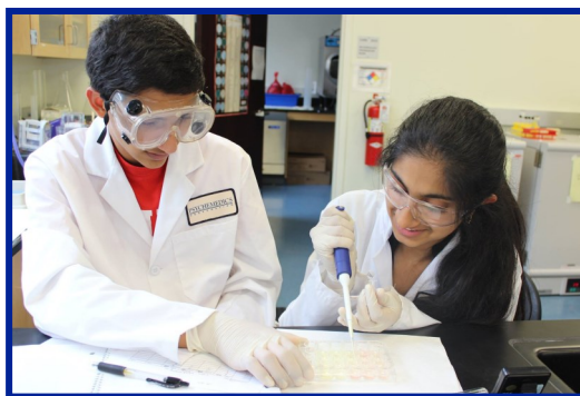
National Finalist micropipetting a sample for analysis.

The four gold medalists from the National Finals represent the United States at the International Biology Olympiad (IBO). The 2018 IBO will be held in Tehran, Iran July 15 to 22, 2018.